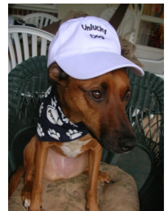
What? We are Top Dog and Unlucky Dog? And we lost? Dang Over Time!