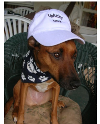
That Peyton Manning can suck all the fun out of this game if you are not on his team.